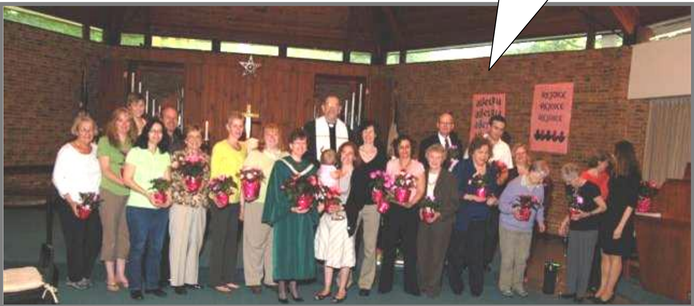
All the people who have worked with the children of the church this year