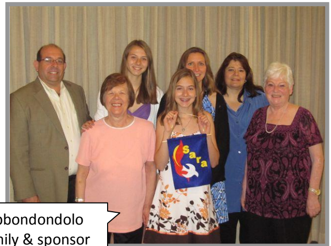
Abbondondolo family & sponsor